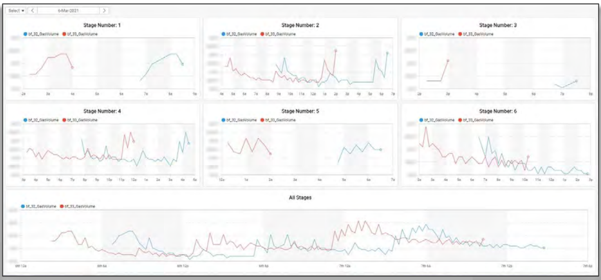
Above: Operator dashboard compares performance of select ovens's recipe stage.