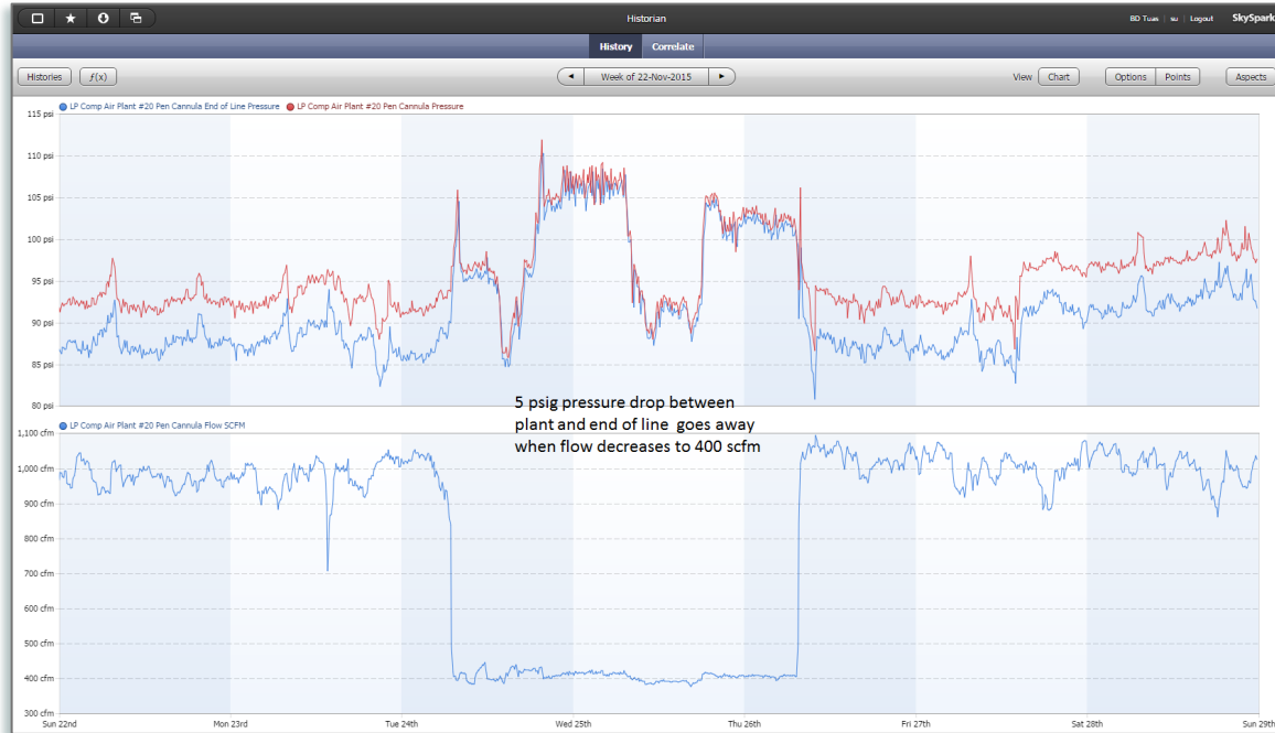
Figure 3: This SkySpark screen shows that the 5 PSIG pressure drop (loss) between the plant and the end of line goes away when flow decreases to 400 SCFM.