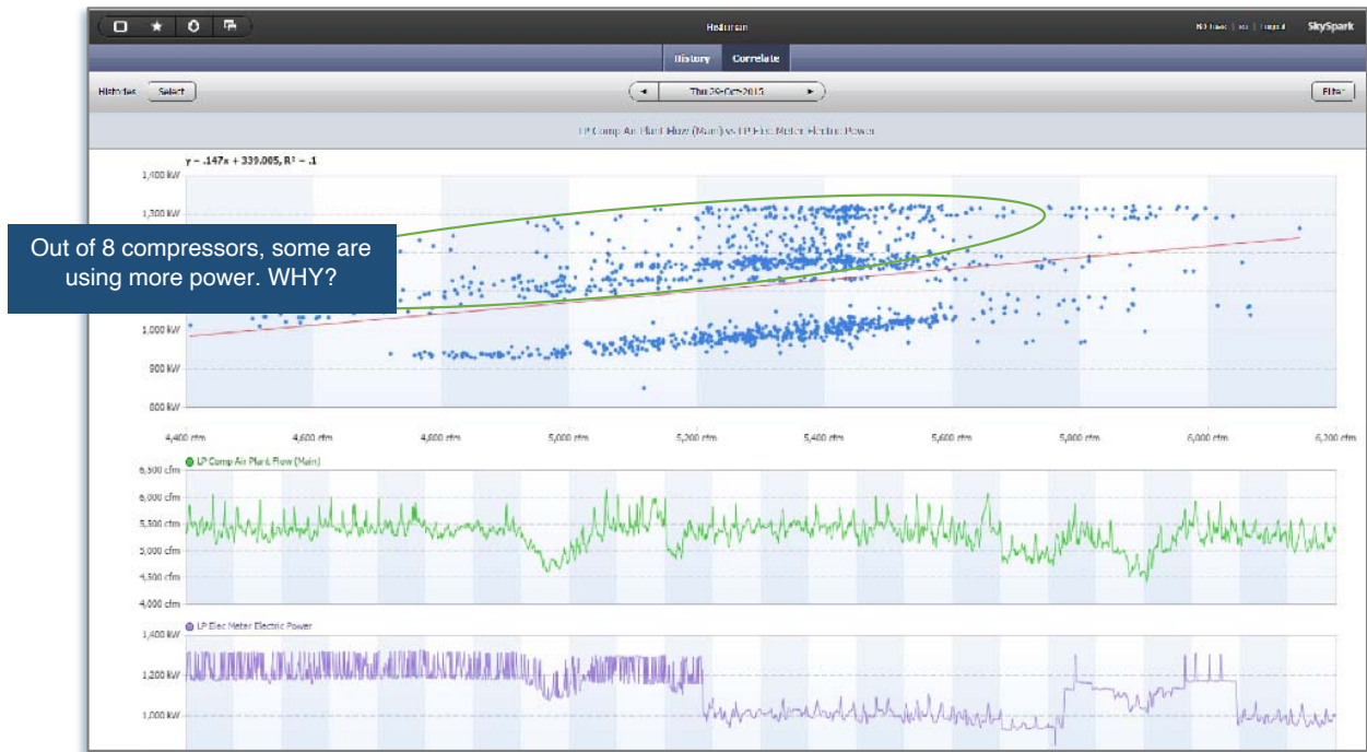
Figure 1: Power and Flow Correlation - Operational Insight Note the large fluctuations in power, while flow and pressure remain relatively constant. We worked with plant operators to evaluate compressor staging.