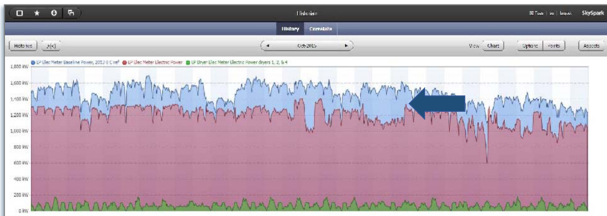
Figure 2: Baseline vs. Actual Energy Use The difference in baseline power calculated (blue) compared to actual power (red) demonstrates savings over time due to implementation of efficiency measures.